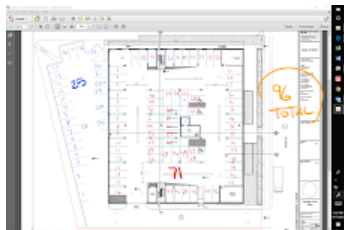
HOGES - parking-B.png 1181K