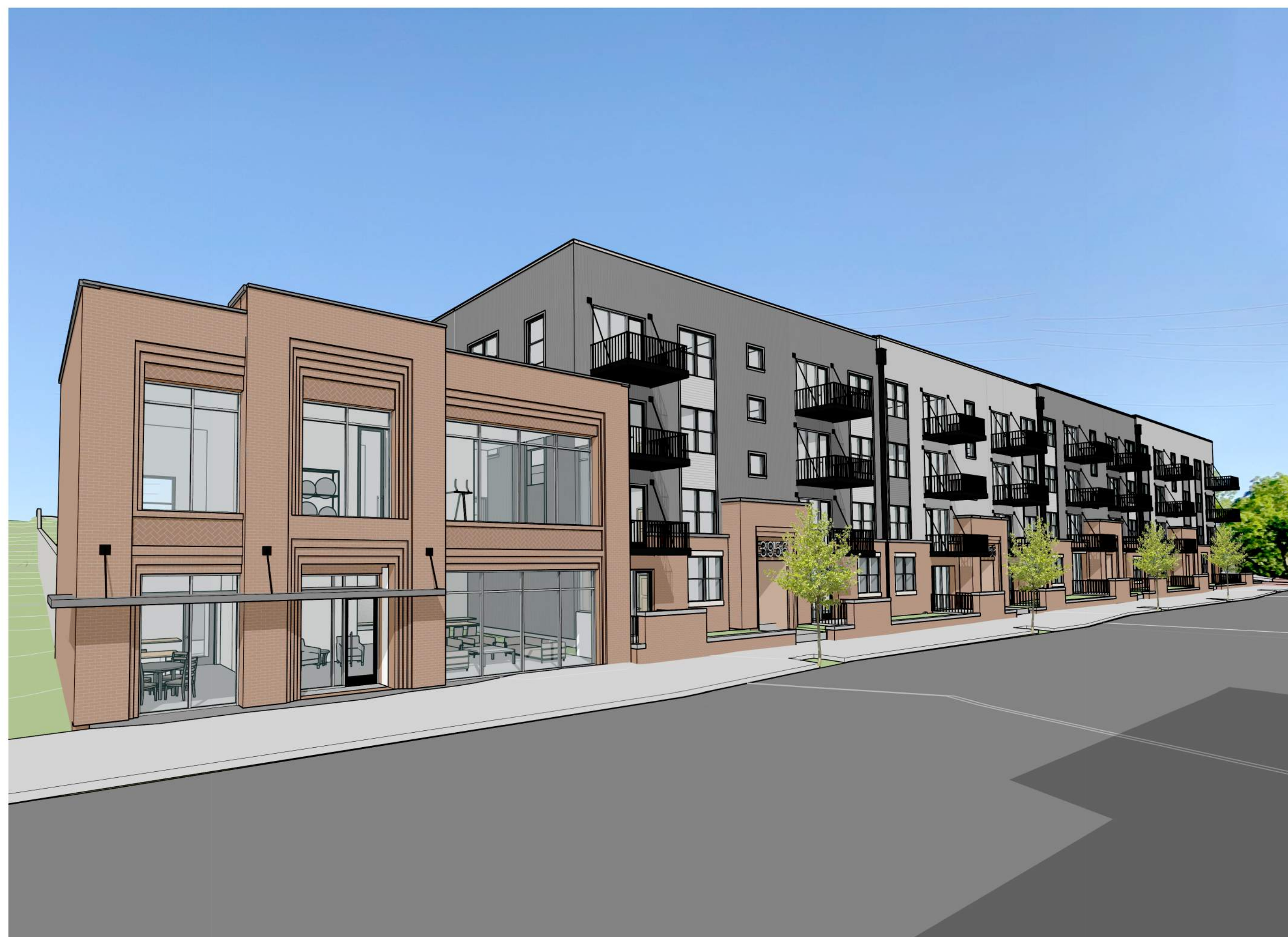
1 3D View Building 1 South West A6.35