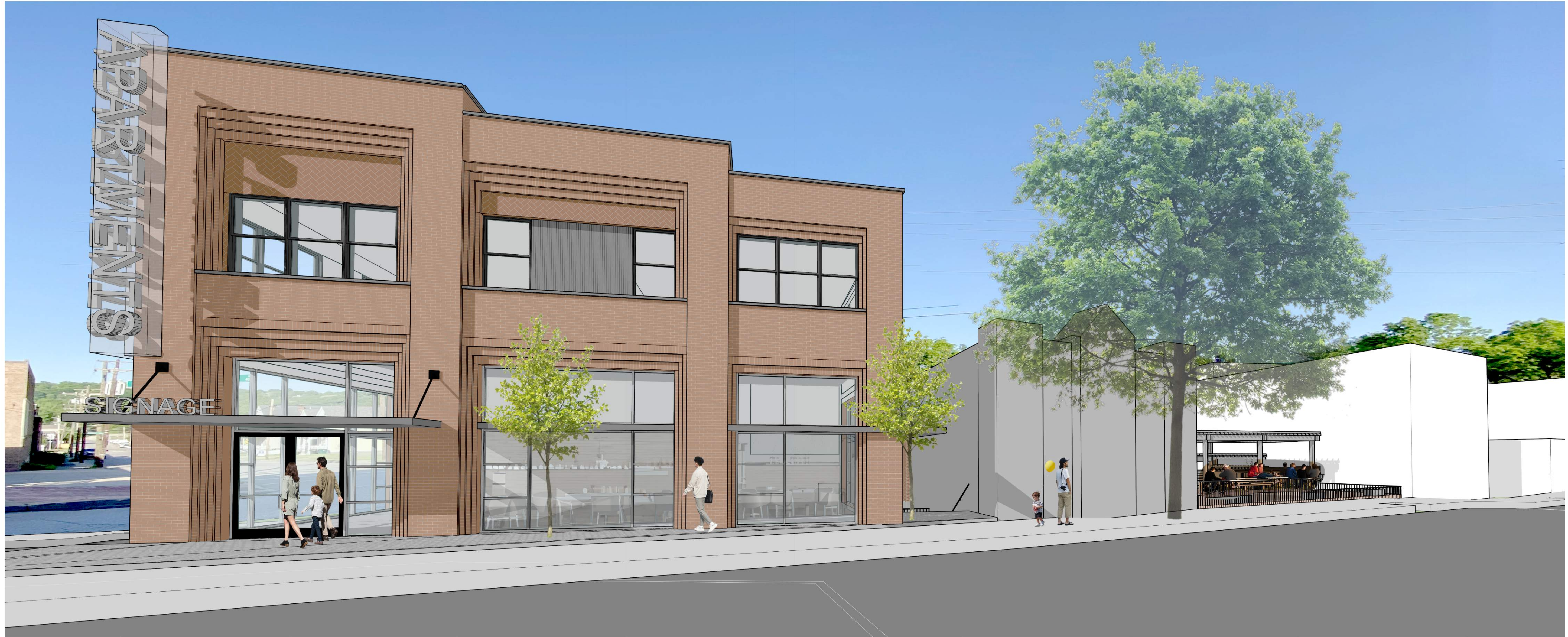
3 3D View Building 2 South A6.35