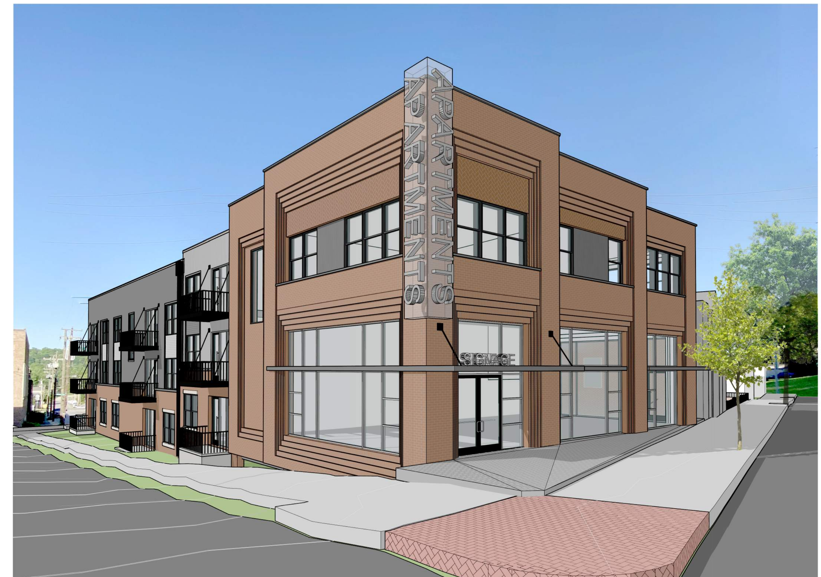
2 3D View Building 2 North East A6.35